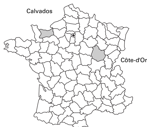
Figure 1 Location of the two regions involved in the study.

considered for this study. We define rectal cancer as cancer arising from the rectal ampulla only—that is, cancers located within 15 cm of the anal verge.