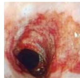
See p 142