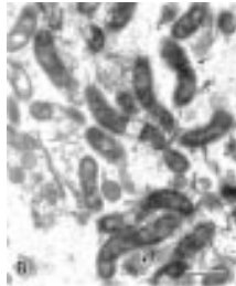
See p 474