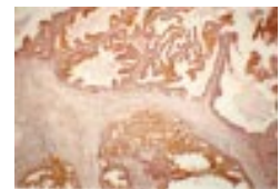
See p 361