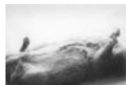
See p 387