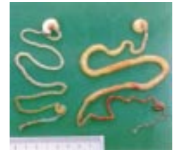
See p 355