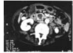
See p 549