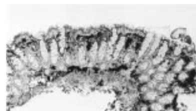
Figure 1 Rectal mucosa in remission in a patient treated in the past for ulcerative colitis. Note the arrangement of lysozyme laden muciphages along the muscularis mucosae, both underneath the superficial epithelium and at the base of the crypts (Lysozyme-Muramidase without counterstain, 25 \times ).

The lysozyme rich granules in Paneth cells appears to be one of the main sources of antimicrobial peptide in the normal small bowel (where Paneth cells are normally present). Although such cells are not found in the normal colorectal mucosa, Paneth cell metaplasia may be present in the colorectal mucosa of some (but not all) patients with longstanding IBD. Demonstration of human neutrophil defensins (HNP 1–3) and lysozyme in epithelial cells of active IBD 2 has fuelled interest in