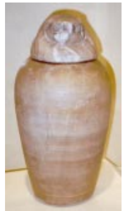
See p 886