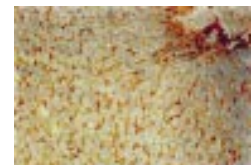
See p 440