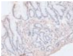
See p 356