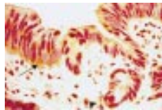
See p 316

NEW ONLINE SUBMISSION GO TO WEBSITE TO SUBMIT YOUR MANUSCRIPT