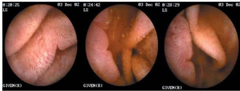
Figure 1 Notching on folds and notching with an inflammatory penumbra.

the anatomy of the valve. WCE on the other hand does not always reach the ileocaecal valve because of delayed transit.