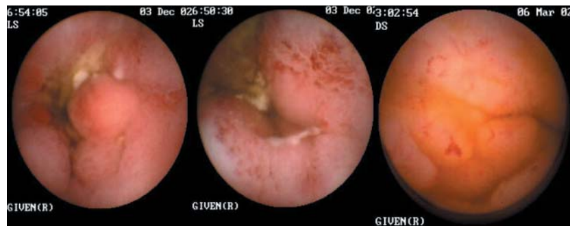
Figure 3 Crohn's vasculitis.

fragments which can easily pass through strictures