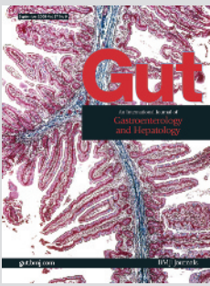
Cover: Light micrograph of a section of the human jejunum.

Journal of the British Society of Gastroenterology