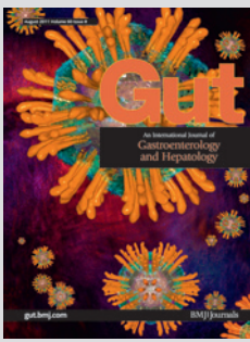
Caption: Hepatitis C virus. Computer artwork of hepatitis C virus (HCV) particles (virions), the cause of hepatitis C liver disease. Each virion has a symmetrical protein coat or capsid (blue), from which project surface protein molecules (orange) that help the virus attach to its target cell. The capsid contains strands of RNA (ribonucleic acid, not seen), the virus' genetic material. Hepatitis C is most commonly spread by blood contact, through blood transfusions or the sharing of infected needles. It causes inflammation of the liver with jaundice and flu-like symptoms. There is currently no vaccine for hepatitis C.

An international journal of gastroenterology and hepatology