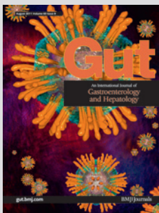
Caption: Hepatitis C virus. Computer artwork of hepatitis C virus (HCV) particles (virions), the cause of hepatitis C liver disease. Each virion has a symmetrical protein coat or capsid (blue), from which project surface protein molecules (orange) that help the virus attach to its target cell. The capsid contains strands of RNA (ribonucleic acid, not seen), the virus' genetic material. Hepatitis C is most commonly spread by blood contact, through blood transfusions or the sharing of infected needles. It causes inflammation of the liver with jaundice and flu-like symptoms. There is currently no vaccine for hepatitis C.

An international journal of gastroenterology and hepatology