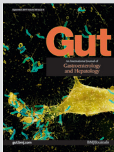
Caption: Helicobacter pylori bacteria. Coloured scanning electron micrograph (SEM) of Helicobacter pylori bacteria (green) on a cell from the lining of the human stomach. Formerly known as Campylobacter pyloridis , these are Gram-negative spiral-shaped bacteria. Colonies of H. pylori are found in the mucus lining of the stomach. They cause gastritis, and are also the most common cause of stomach ulcers. H. pylori may also be a cause or co-factor for gastric cancer, as its presence increases the risk of developing stomach tumours.