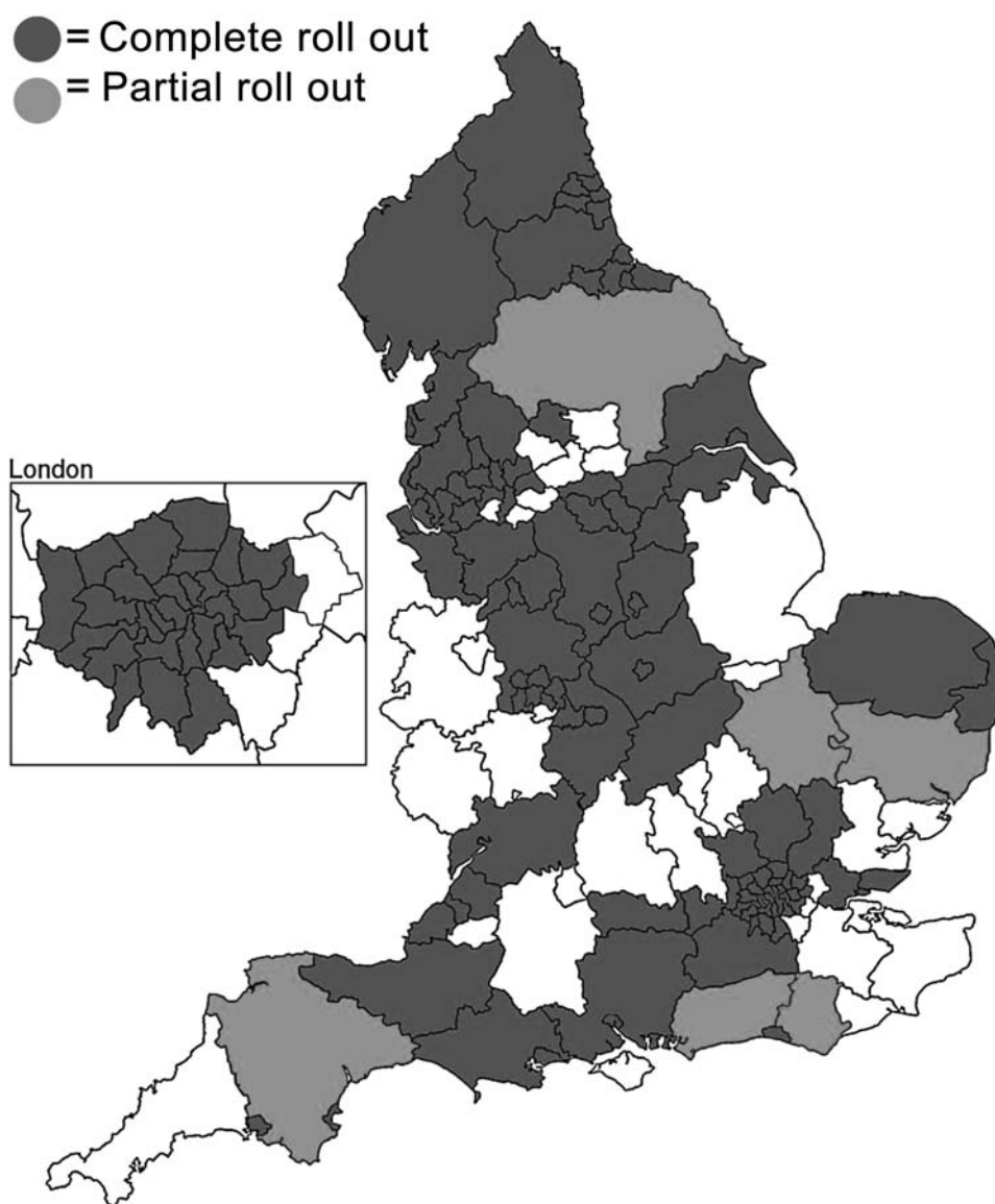
Figure 3 Extent of roll out of Bowel Cancer Screening Programme by primary care trusts in October 2008.

than women (1.5%) ( \chi^2=1445 , p<0.00001 ). This difference was of similar magnitude across all areas.