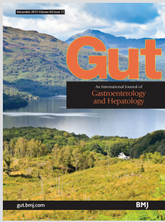
Caption: The bonnie banks o' Loch Lomond, Scotland. Please see inside this issue two excellent papers from Scotland.

An international journal of gastroenterology and hepatology