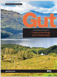
Caption: The bonnie banks o' Loch Lomond, Scotland. Please see inside this issue two excellent papers from Scotland.

An international journal of gastroenterology and hepatology