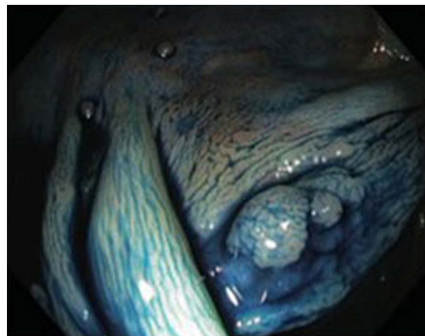
Figure 4 A neoplasia-associated lesion in a patient with long-standing UC. This sessile polyp (Paris I) is well delineated and detectable without chromoendoscopy. Chromoendoscopy helps to characterise it. It has a type IV Kudo pit pattern and can be easily distinguished from the other small sessile polyps located at the upper left part of the same image, which correspond to pseudopolyps.