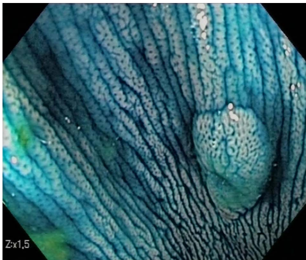
Figure 3 A slightly elevated lesion (Paris IIa) in a patient with long-standing colitis. Colonoscopy revealed a well delineated, regular and small polyp located at sigmoid colon. The lesion has a type II Kudo pit pattern and disrupts innominate lines. This type of lesion was well documented as hyperplastic lesion.

Our study has some limitations. Although the study more closely reflects real life than a randomised controlled trial, its external validity to a general practice scenario maybe burdened