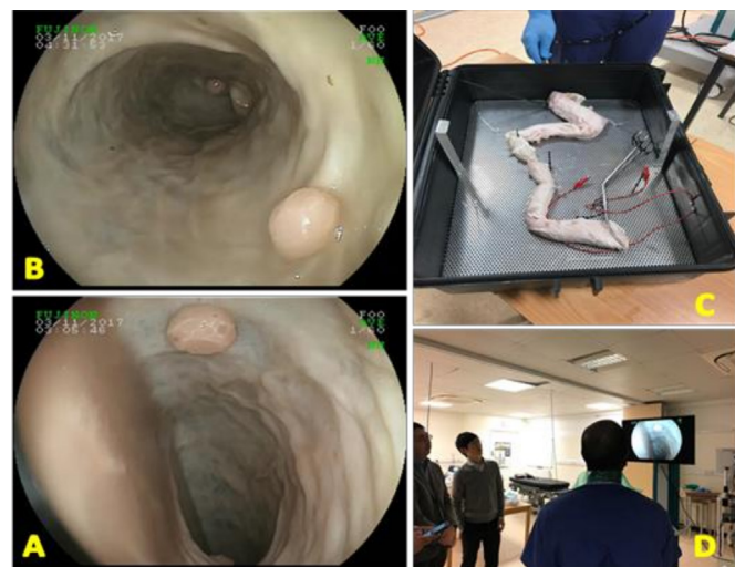
Figure 2 Images (A) and (B) are examples of the phantom polyps as viewed by the endoscope in the pig colon model. Image (C) shows the pig colon model being scoped. Image (D) shows the real-time endoscopy view during the experiment.

Polyp size is related to the risk of cancer and influences surveillance intervals and therapeutic approaches. 1 The 5 mm threshold is particularly important because it influences the implementation of optical diagnosis-based strategies including resect and discard/diagnose and leave approaches and also allows endoscopists to make therapeutic choices of cold versus hot polypectomy. 2 However, visual size estimation by endoscopists has a significant interobserver variability and error rate, 3 and other methods showed variable and sometimes contradicting results. 4