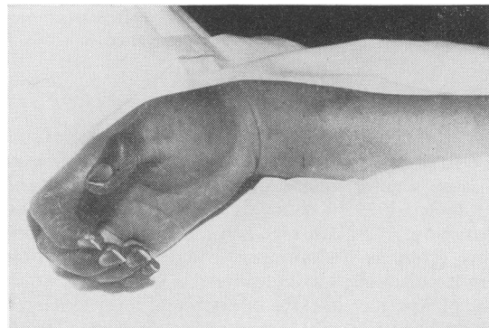
FIG. 1. Peripheral gangrene in the right hand. Both radial and ulnar pulses were absent.

Despite the improvement in the limbs, the liver showed no evidence of regeneration. In the second week she gradually went into hepatic and renal failure and died on 17 May. At necropsy the liver was small and shrunken and weighed only 700 g. Histologically the appearances were those of massive hepatic necrosis with early nodular regeneration. The changes were compatible with a viral