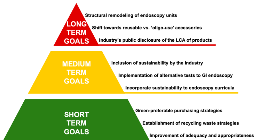
Figure 1 Steps towards sustainable endoscopy. GI, gastrointestinal; LCA, life cycle assessment.

is to improve waste sorting, as discussed above. In addition, industry must be challenged to improve packaging and other components of their products, for example, multilingual instructions for use of plastic stents, which could be replaced with a quick-response (QR) code. Regulations mandated by the authorities could be challenged by users and industry together to improve the situation further.