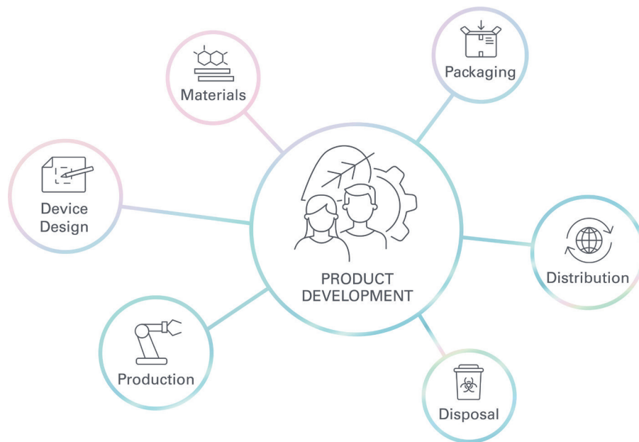
Figure 2 Endoscopy design principles taking materials, packaging, device design, distribution, manufacturing and disposal into account during the product development process.

hazards that make health systems vulnerable, including droughts, extreme heat, wildfires, flooding, hurricanes and ice storms. These hazards vary based on geography, patient populations and infrastructure (physical and social). Using resources like the US National Risk Index map 10 can aid in identifying natural hazards your health system faces, facilitating better planning. Healthcare systems are intricate, involving various stakeholders and supporting operations across many facilities. If any element fails, the continuity of medical services suffers. Every component—patients, supplies, staff, backup generators, facilities—encompass assets required to maintain effective functioning. Climate hazards present unique risks to each of these assets, which must be identified. Figure 1 shows an example of a risk assessment of potential asset-hazard pairs—these pairs are variable depending on which climate hazards are relevant for that site.